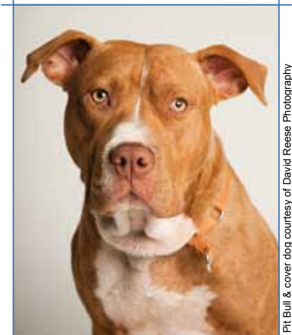
Pit Bull & cover dog

Approximately 17% of dogs that enter the Santa Cruz County Animal Shelter are Pit Bulls. Our “special” price for spay/neuter for our community’s Pit Bulls reflects our commitment to their welfare and the welfare of our community.